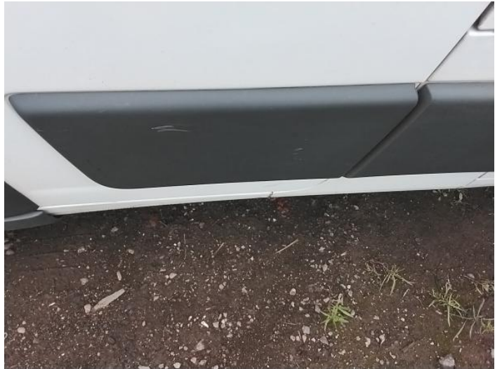
4: Door Moulding nsf Scuffed (Unpainted) UpTo 100mm