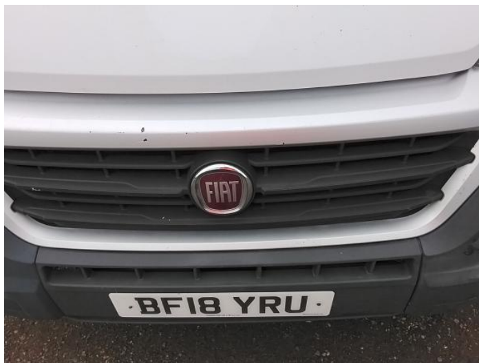
2: Panel Front Chipped Multiple Chips