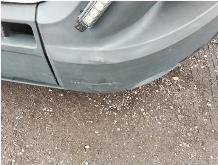
3: Bumper Front Dented Over 30mm