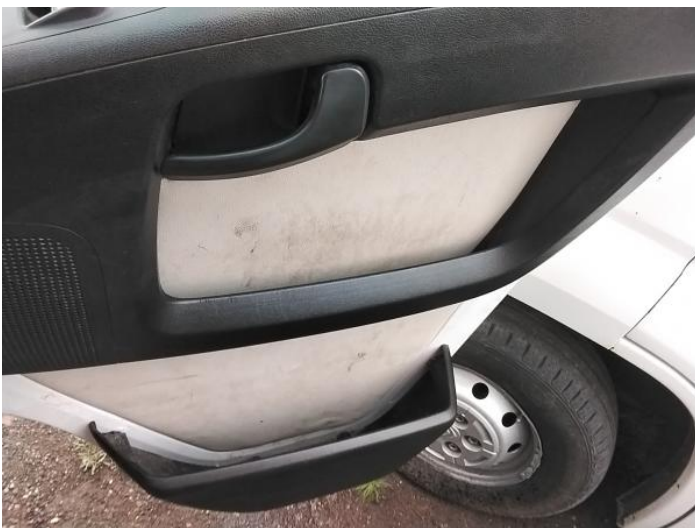
7: Door Pad osf Soiled Heavy