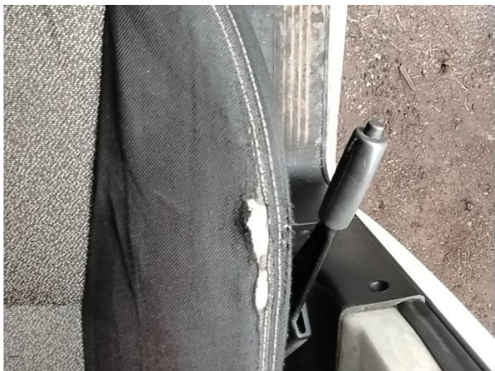
9: Seat Base Cover osf Torn Over 3mm