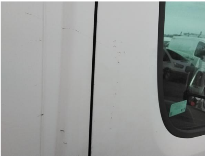
5: Door osf Chipped Multiple Chips