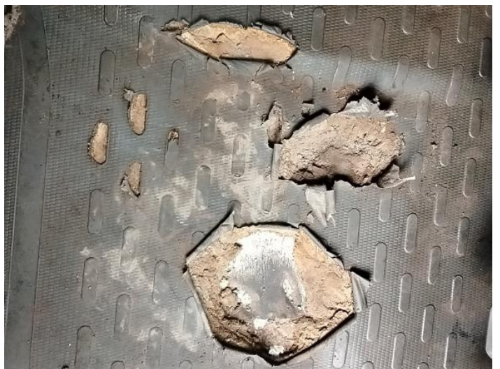
8: Carpets Front Holed Over 3mm