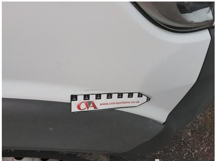
6: Wing osf Scratched Over 25mm Thru Paint