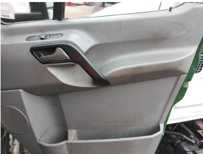
13: Door Pad osf Soiled Heavy