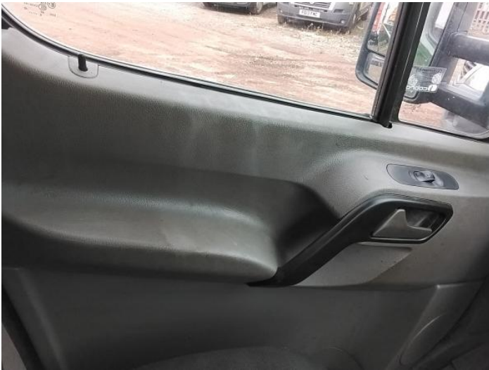
17: Door Pad nsf Soiled Heavy