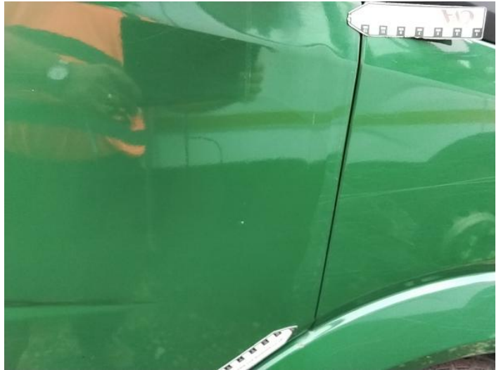
10: Door osf Dented Over 30mm