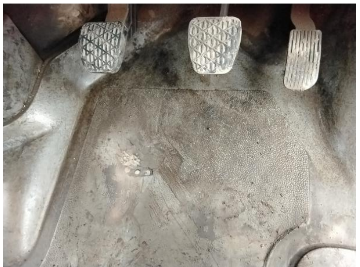
14: Carpets Front Holed Over 3mm