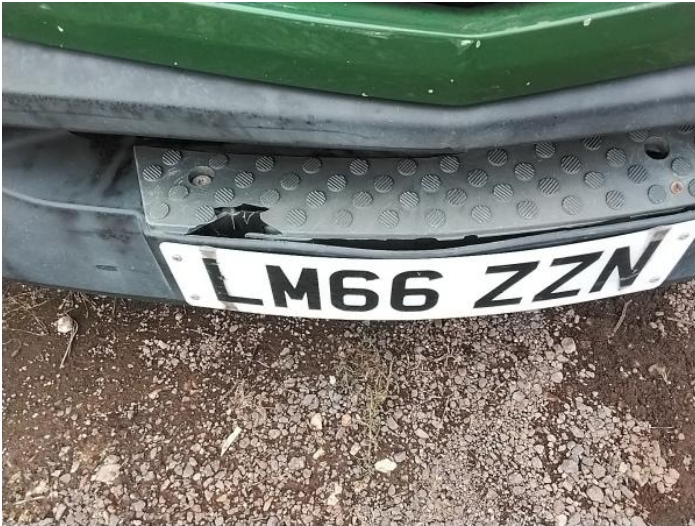
3: Bumper Front Moulding Broken Replace