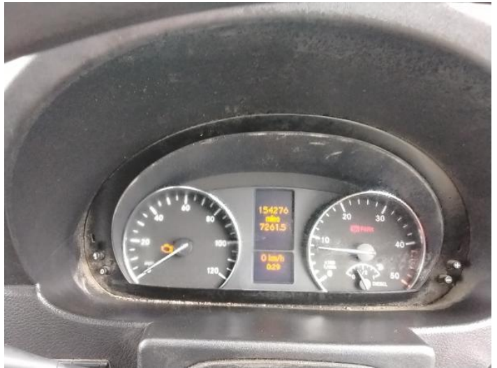
18: Dash Warning Lights Displayed No Action