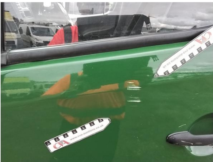
7: Door nsf Dented With Paint Damage