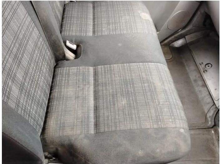
16: Seat Base Cover nsf Soiled Heavy