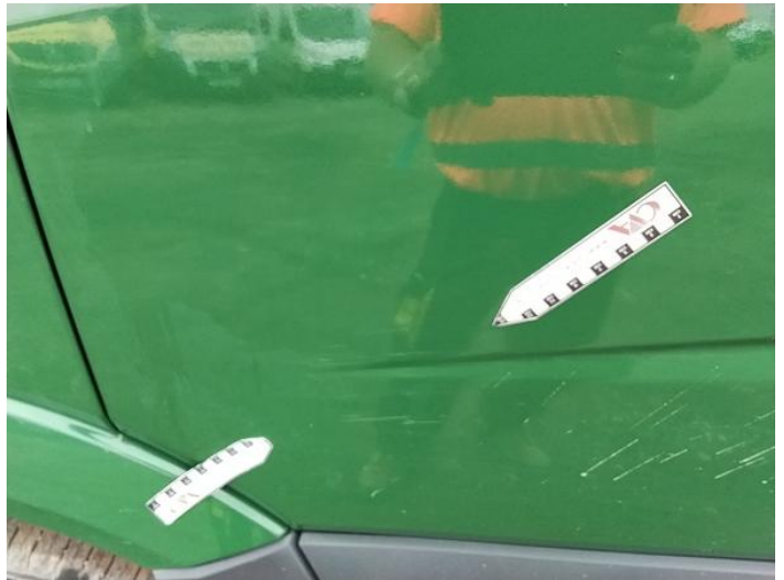
6: Door nsf Scratched Over 25mm Thru Paint