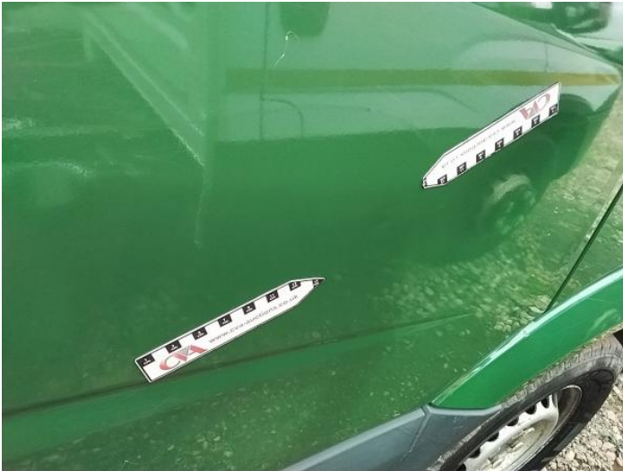
9: Door osf Dented Over 30mm