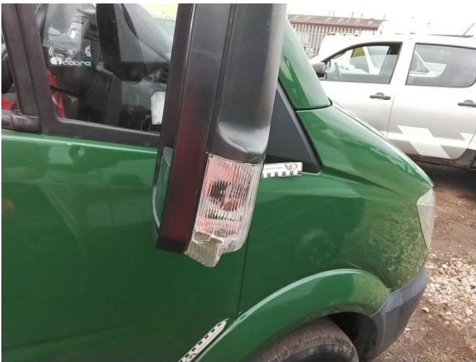
11: Door Mirror Assy osf Broken Replace