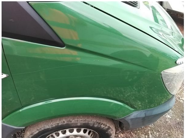
12: Wing osf Scratched Over 25mm Thru Paint