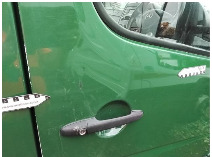
8: Door osf Dented Over 30mm