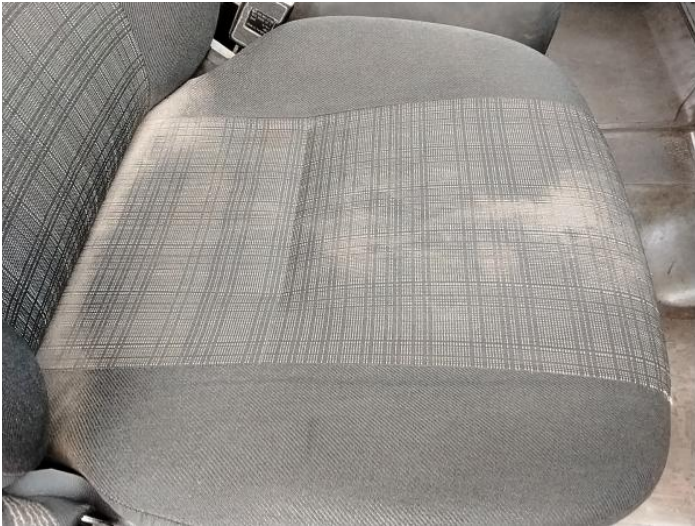
15: Seat Base Cover osf Soiled Heavy