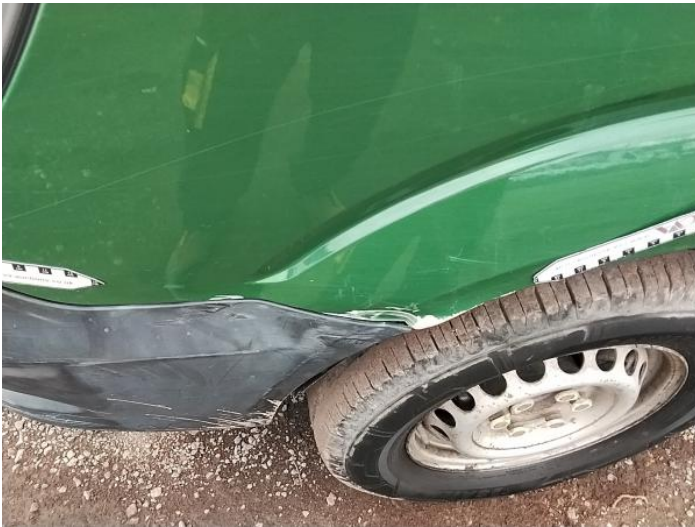
5: Wing nsf Dented With Paint Damage