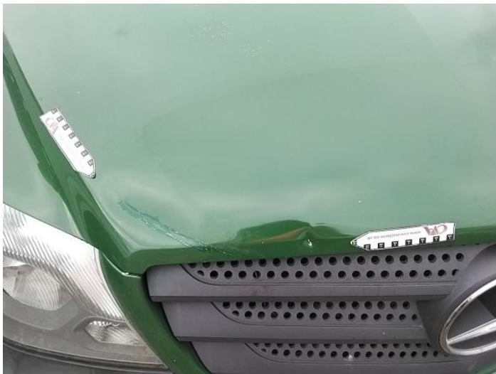
1: Bonnet Dented With Paint Damage