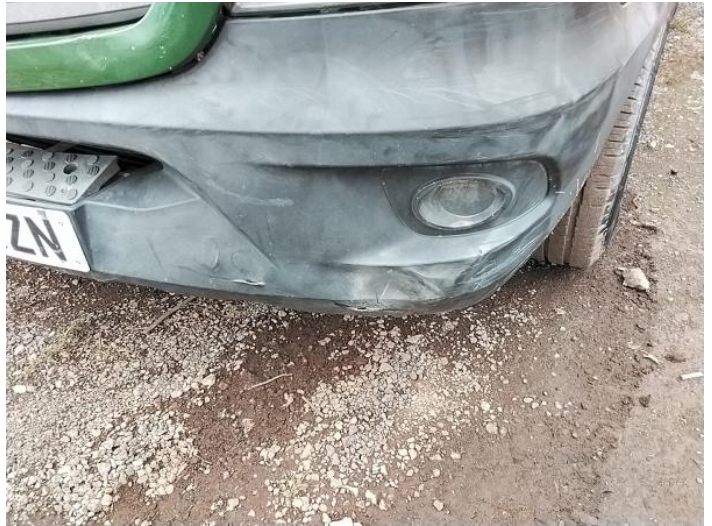
4: Bumper Front Cracked Over 25mm